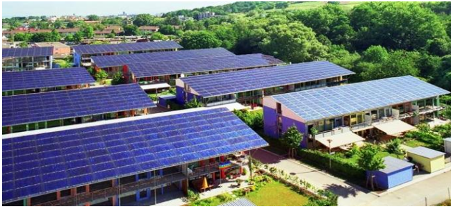
Fig. 3.1: German solar city produces four times more energy than it uses. German architect Rolf Disch one-upped them all by creating an entire solar city. Sonnenschiff in Freiburg is a small community that is entirely powered by the Sun, with rooftop solar panels everywhere you turn. Combined with Passive hausprinciples that utilize energy efficiently, the city can generate up to four times as much electricity as it needs.