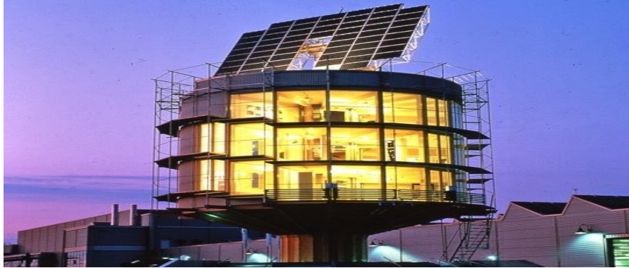
fig 5.1.1: The spinning, sun-chasing Heliotrope designed by Rolf Disch. It can generate up to five times as much power as it needs to operate. The home sports a giant angled solar array on the roof and the entire structure is mounted on a pole timed to rotate 180 degrees each day as it follows the sun.

designed for immense energy efficiency, it can even reach the point of becoming a net zero energy home, producing as much or more energy than it needs!