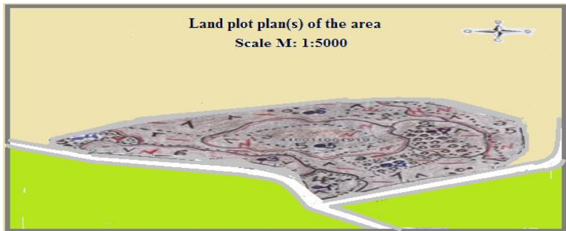
Fig.1 Land plot plan (s) of the area the village Malham of the Shamakhi

Shamakhi region, where it was decided to set up experiments in the period 2007-2009. for which it is shown in the table! water-physical and agro-chemical properties of the soil of the object of research, experiments that were carried out on the territory of the village Malham of the Shamakhi region. The results of our analysis showed that on the territory of the Shamakhi region widespread mainly degraded mountain brownish-brown soils are mainly widespread.